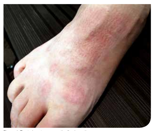
Figure 4. Treated warts one month after laser therapy