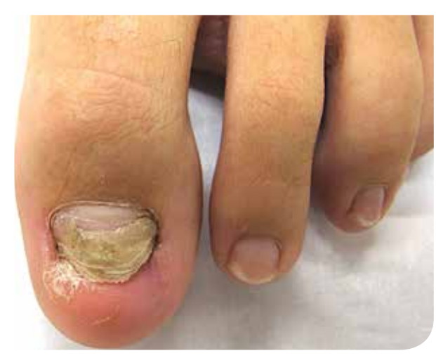
Figure 1. Nail before treatment; the left big toenail shows extensive onychomycosis

additional therapy. Although these initial promising findings need to be confirmed in a randomised trial, the few treatments required, high patient acceptability and avoidance of systemic antifungal drugs makes it appealing as a first-line therapy for this common disease. Figures 1 and 2 show images of a nail before and after laser therapy.