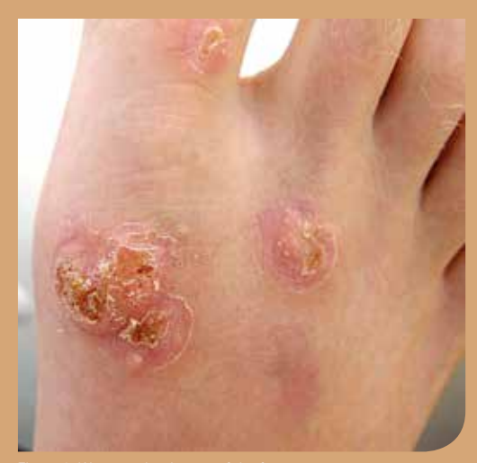
Figure 2. Warts on the dorsum of the foot