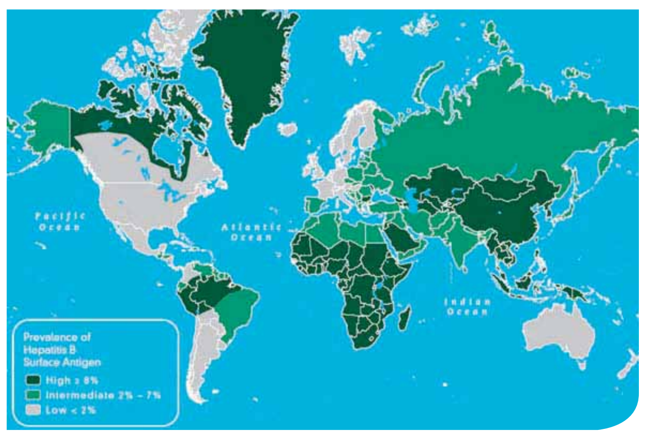
Figure 1. Prevalence of chronic infection with hepatitis B virus in different parts of the world Reproduced with permission<sup>12</sup>

www.cdc.gov/mmwr/preview/mmwrhtml/rr5516a1.htm