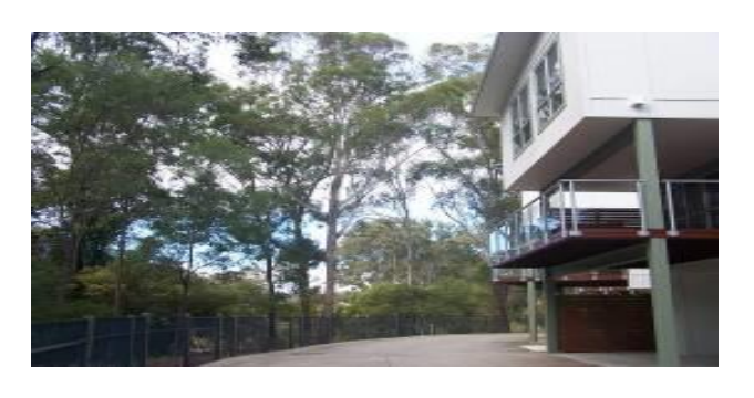
"Azzura Eco" 28 Castello Circuit, Varsity Lakes – GRV $25,500,000 partly funded by Guardian Securities.