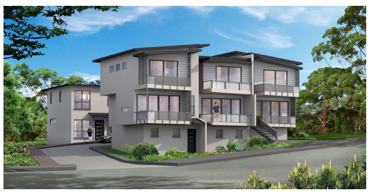
15 Rutland Street Coorparoo Qld - construction of 5 townhouses

Each of the Directors has consented to and authorise the issue of this PDS.