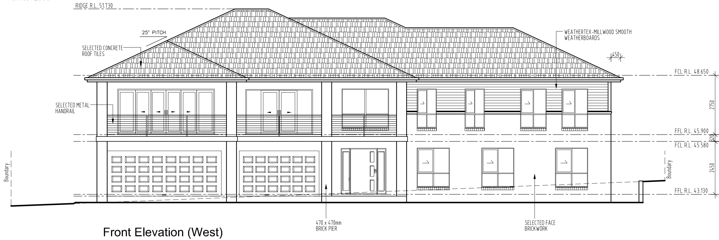
Front Elevation (West)